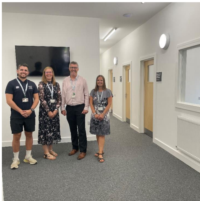
New Pastoral Suite

In addition to the Pastoral Suite, some departments have benefitted from brand-new carpet and air-conditioning units. I will continue to look at improving the site to ensure we can offer the best facilities to both our staff and students and I look forward to the next phase of refurbishment in the not so distant future.