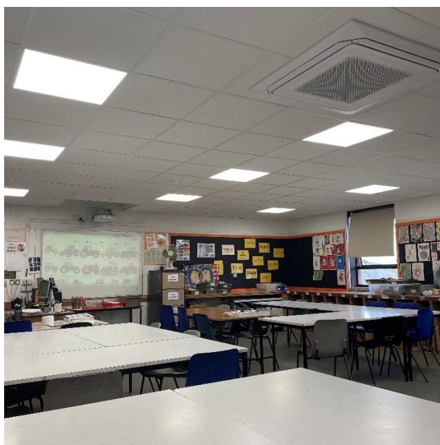
New air-conditioned art classroom

It has genuinely been a very positive start to this academic year and I am looking forward to working with staff and students to continue building upon the successes of last academic year.